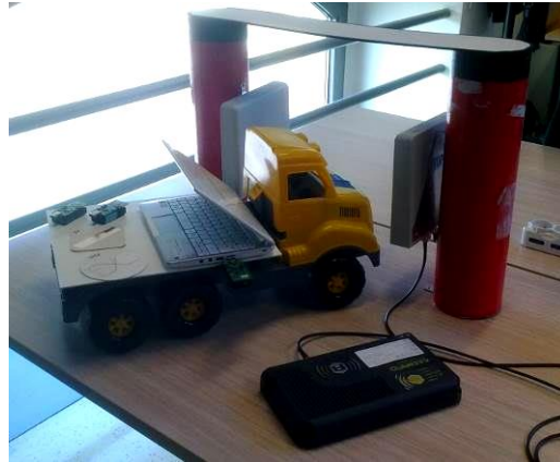
Figure 5 - Food Transportation simulation