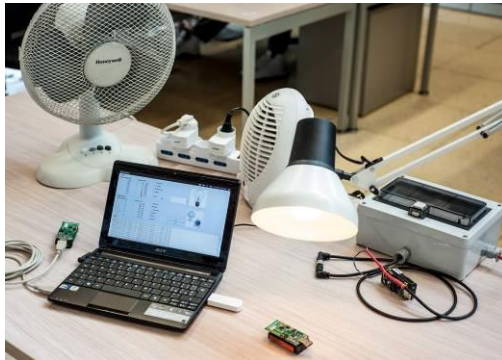
Figure 2 - Cooling and Lighting System