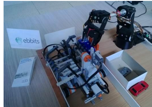
Figure 3 - Robot Control