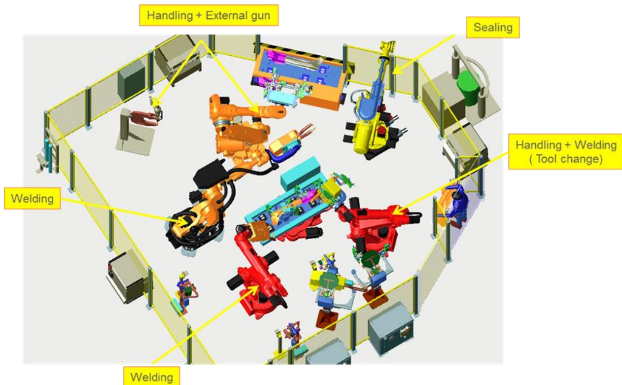
Figure 4: COMAU Innovation Centre - Showroom